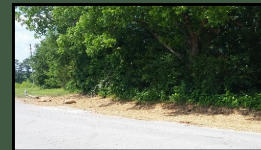
Shoulder Work at Etheridge Road