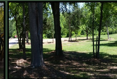
Demolition: Block Houses: Ninth Street Before and After